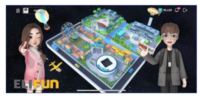
▲ Company E's educational metaverse

Development case using K-VaRam solution -